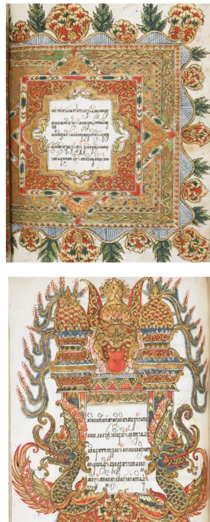
FIGURE 2. Illumination page 31r – floral figure (above) & page 41v – scale motif (below)

The process of selecting figures in the illuminations has been selected based on the suitability of the shape for Yogyakarta's written batik. There are 4 figures, namely a peacock, a plant and its tendrils, as well as a scale-like motif. All of these figures are composed so that they are suitable for making batik motifs. The motifs are made manually and then digitized to facilitate the process of transferring them to the fabric which will go through the canting process (figure 3). The process of making a manual sketch is an important stage because it not only tries to find the right composition but indirectly provides a "bond" between the writer and the motif. It provides more imagination and memory about related cultures. This assertion is in line with Pallasmaa's phenomenological concept, that when someone is involved in manually sketching something, it will provide a strong experience