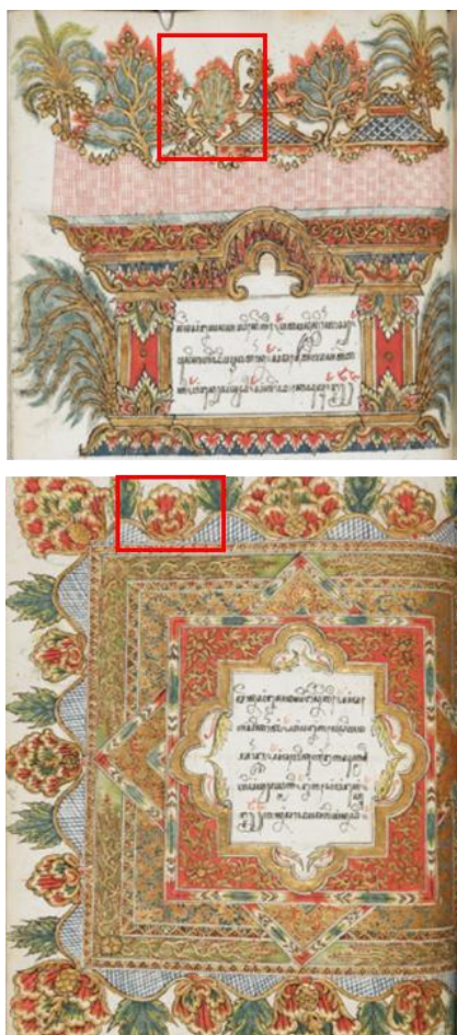
FIGURE 1. Illumination page 22v – peacock figure (above) & page 30v – floral figure (below)

There are certain motifs from several Serat JLW