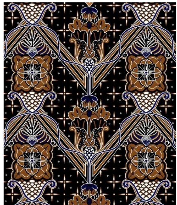
FIGURE 4. Consultation with local batik artisans (above) & batik motif with colour (below)